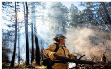
Indigenous and Immigrant Farm Workers Building a Climate Resilience Workforce