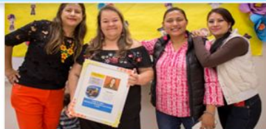
Anchoring Worker Cooperative Hubs

Addressing long-standing inequities and climate vulnerabilities