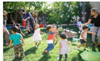
High Road to Early Childhood Education Consortium