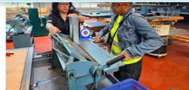
Catalyzing Quality Careers in Building Decarbonization