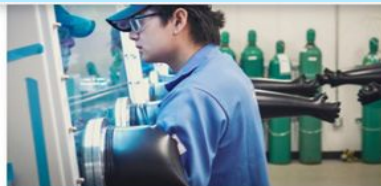
Bay Area High-Road Manufacturing Initiative