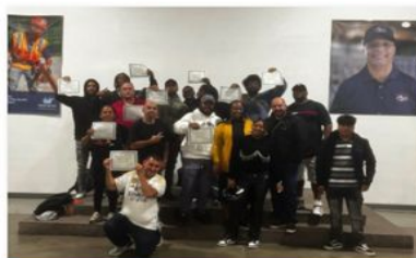
High Road Clean Transportation Career Pathways